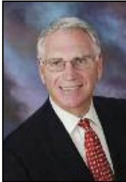
Denham Springs Mayor Jimmy Durbin

Sam's Club – “Sam's Club sent engineers and architects to visit Oct.